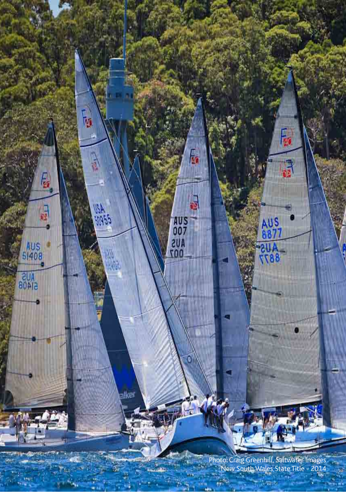
New South Wales State Title - 2014