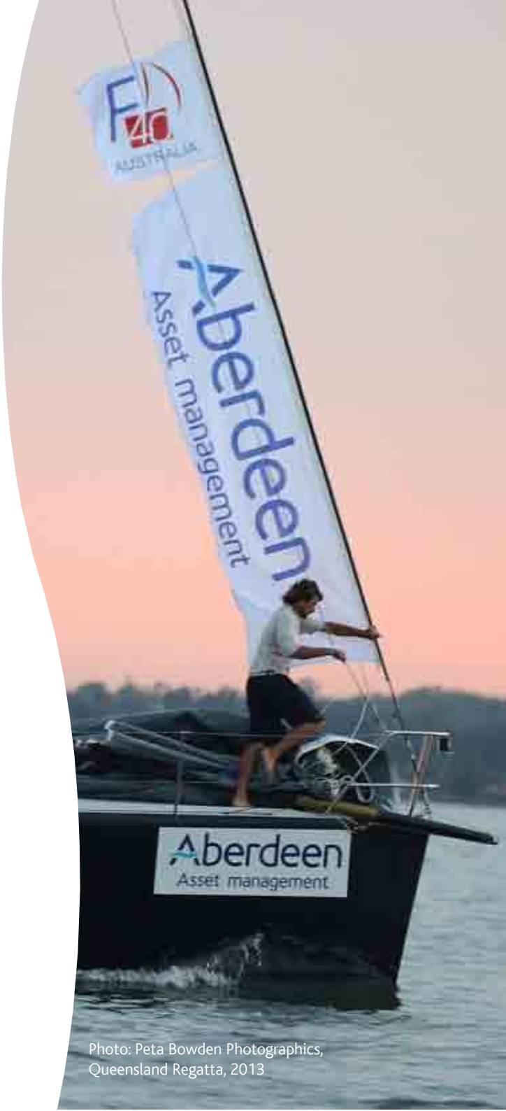
Queensland Regatta, 2013