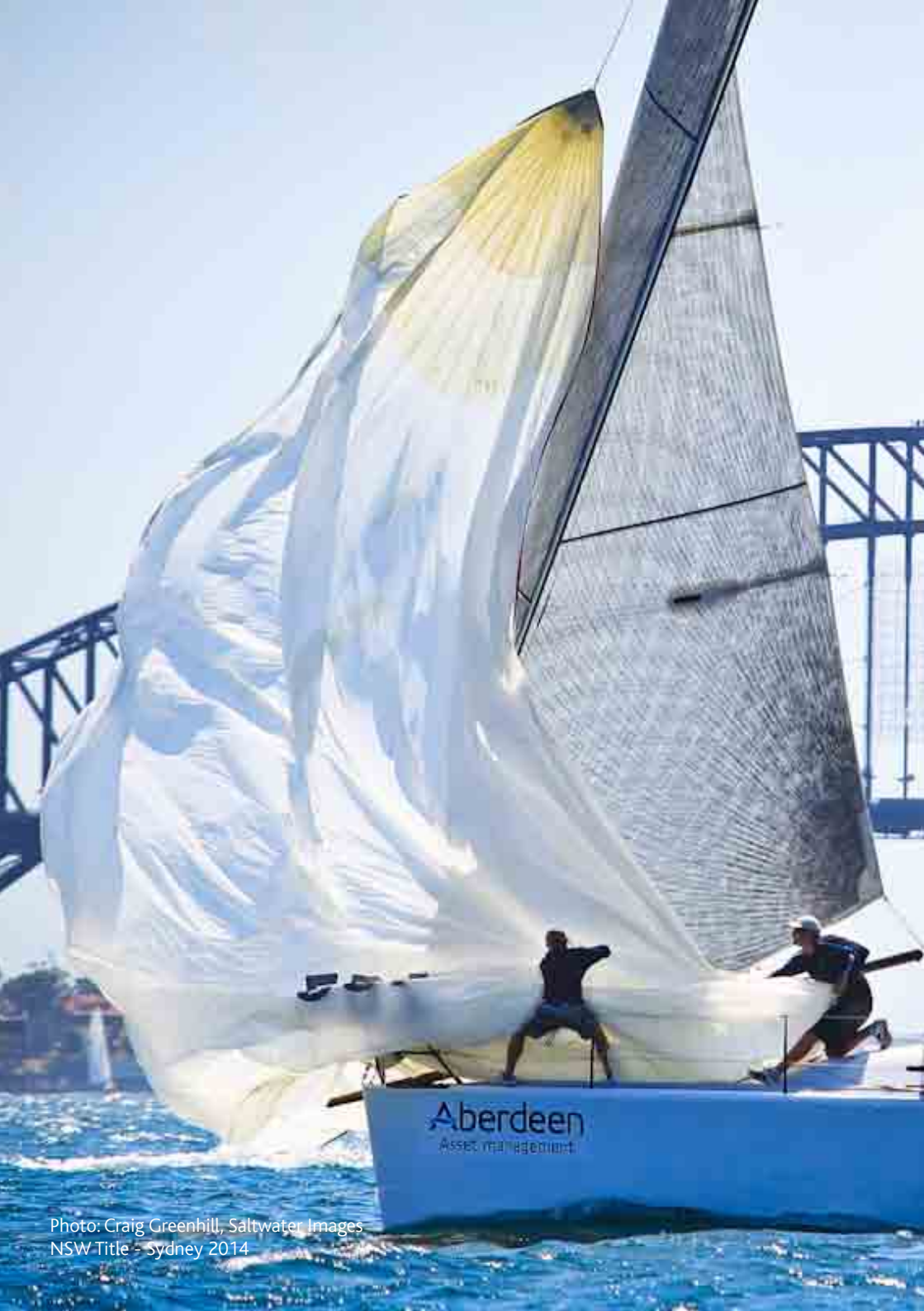
Title - Sydney 2014