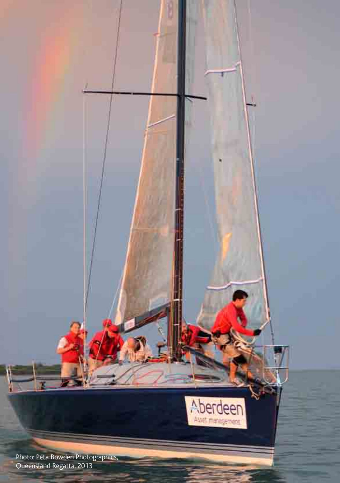
Queensland Regatta, 2013