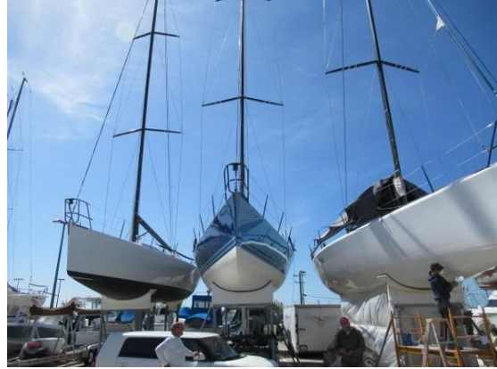
Two tone hull