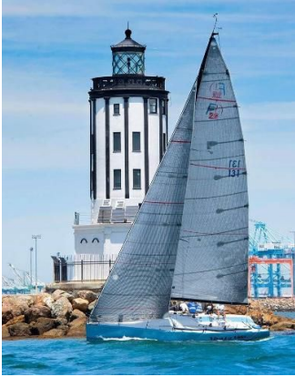
Ripping past the light house