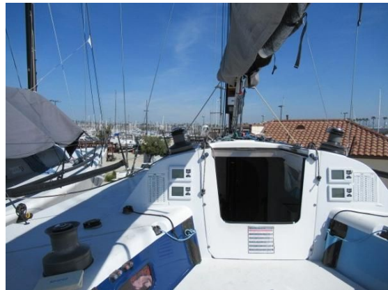
Instruments and companionway