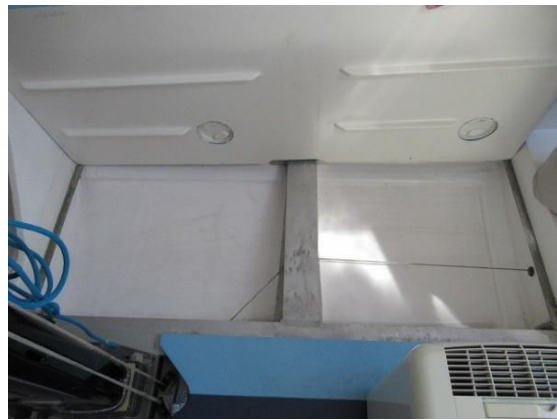
Dry clean bilge