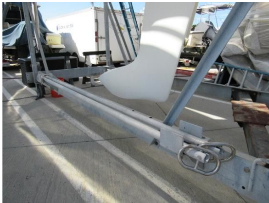
Launching options - Spreader bars for sling